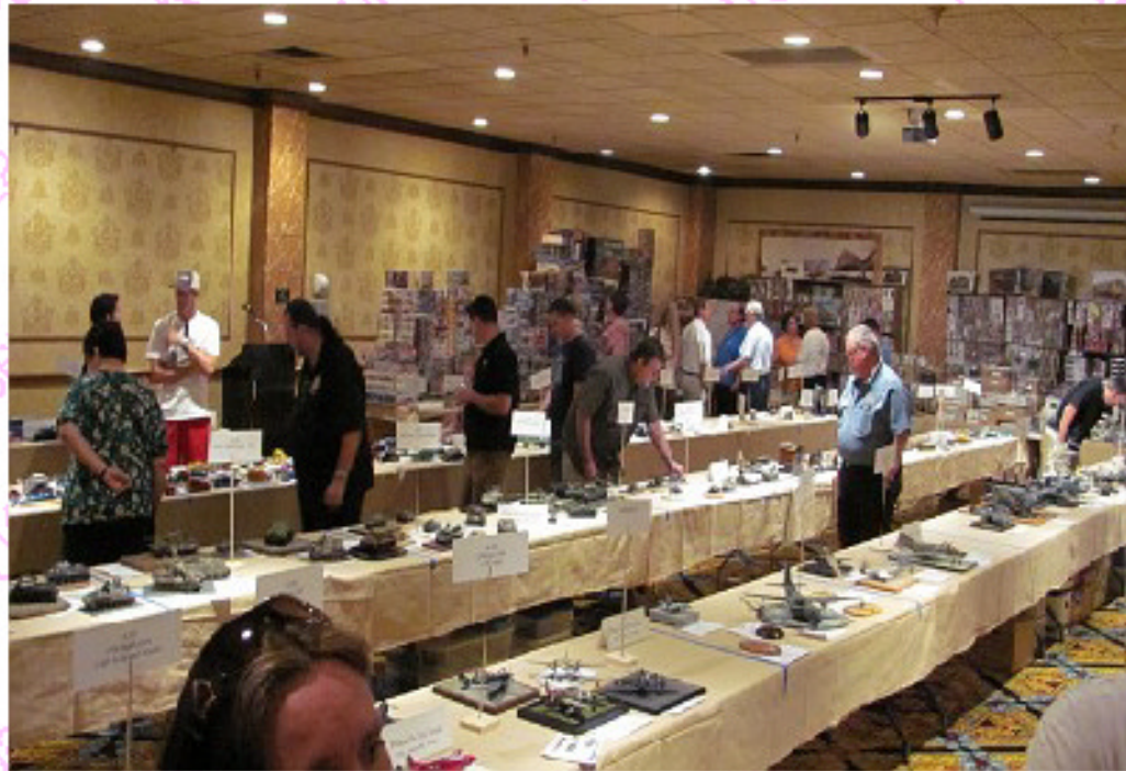
IPMS Las Vegas had their Best of the West Show on May 22, 2010. It was a great show as always.